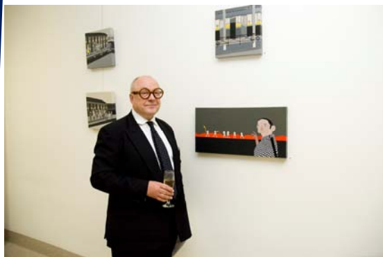
Pictured: Internationally renowned artist Mr. David Milne